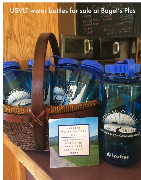
USVLT water bottles for sale at Bagel's Plus

This past year USVLT expanded its effort to increase community awareness about who we are and what we aspire to do. Knowing that everyone